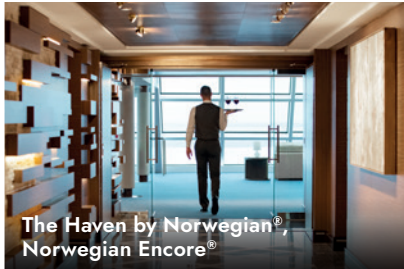
The Haven by Norwegian®, Norwegian Encore®