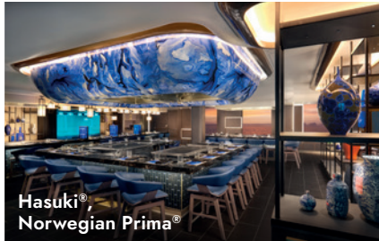
Hasuki®, Norwegian Prima®