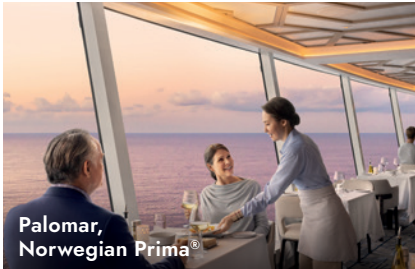
Palomar, Norwegian Prima®

A meal includes one appetizer, one soup or salad, one entrée (main course) and one dessert.